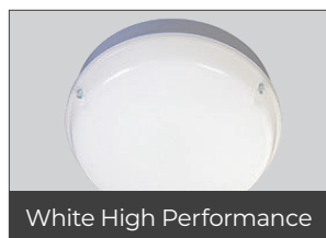
White High Performance