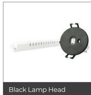
Black Lamp Head

Our ELD3 has been designed as a discreet standalone low-maintenance emergency lighting solution when using decorative luminaires or when there is a requirement for a standalone system. The ELD3 consists of an LED lamp head with an integrated battery, status display LED and an emergency inverter unit to operate the single LED in non-maintained mode. The integrated self-test function corresponds to the European standard. Corridor or open-area lens options are available.