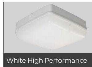
White High Performance