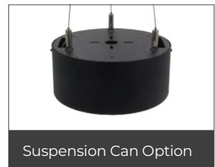
Suspension Can Option