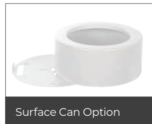
Surface Can Option