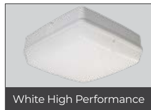
White High Performance