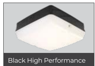
Black High Performance