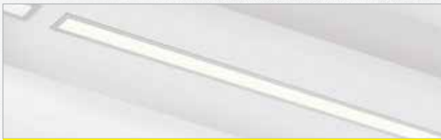
Typical Recessed Installation