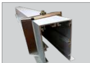
Fitted Recessed Bracket