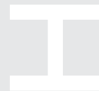
I - Shape