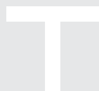
T - Shape