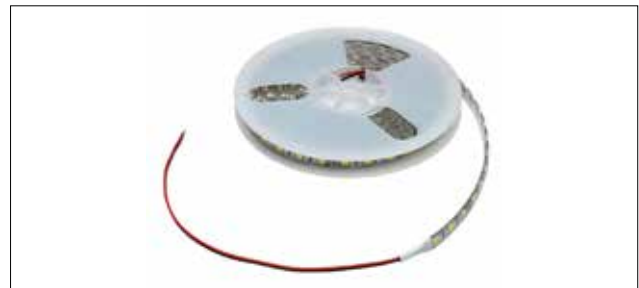
Typical Lamp - 24V LED Tape