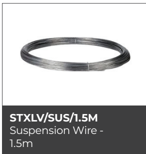
STXLV/SUS/1.5M Suspension Wire - 1.5m