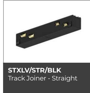
STXLV/STR/BLK Track Joiner - Straight