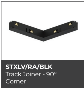
STXLV/RA/BLK Track Joiner - 90° Corner