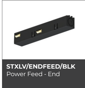
STXLV/ENDFEED/BLK Power Feed - End