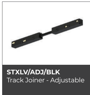
STXLV/ADJ/BLK Track Joiner - Adjustable