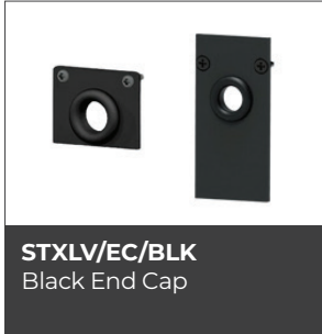
STXLV/EC/BLK Black End Cap