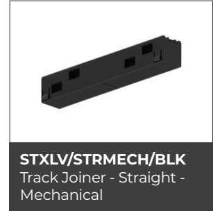
STXLV/STRMECH/BLK Track Joiner - Straight - Mechanical