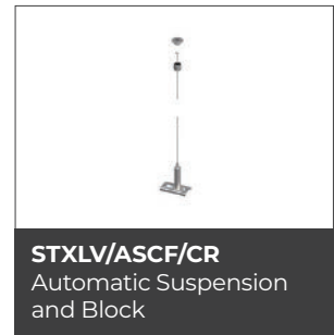
STXLV/ASCF/CR Automatic Suspension and Block