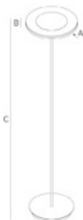
AxBxC (mm) Ø340x25x1800