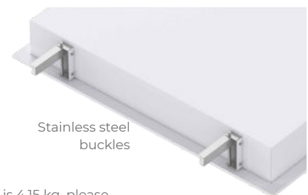
Stainless steel buckles

Note: Product weight is 4.15 kg, please ensure ceiling structure is sufficient.