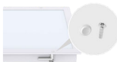
Screw access for ceiling clamps

Note: Product weight is 4.15 kg, please ensure ceiling structure is sufficient.